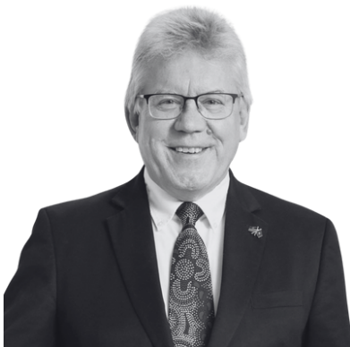
NEIL SCALES OBE